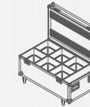
6/1 Flightcase (1320400244)

(Accessories not included unless otherwise stated)